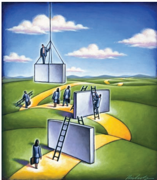
The Mayo Clinic CTSA overcame traditional barriers to academic collaboration to create an integrated approach to training the next generation of clinical and translational researchers.